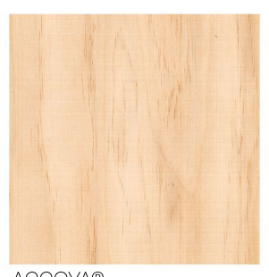
ACCOYA® MODIFIED WOOD NATURAL

Accoya® Modified Wood is based on a proprietary process that transforms fast-growing, certified sustainable timber into a high performing lumber with superior hardness and durability characteristics, including exceptional rot resistance.