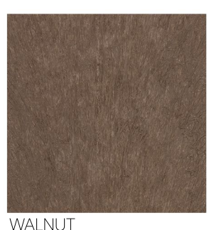
NATURAL WOOD ALTERNATIVES

For applications where wood is preferred, Wishbone has several options. Stains or oils specified by the customer can optionally be applied by Wishbone during manufacture. Contact us for further details.