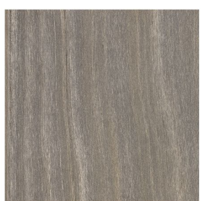
ACCOYA® MODIFIED WOOD GREY

For applications where wood is preferred, Wishbone has several options. Stains or oils specified by the customer can optionally be applied by Wishbone during manufacture. Contact us for further details.