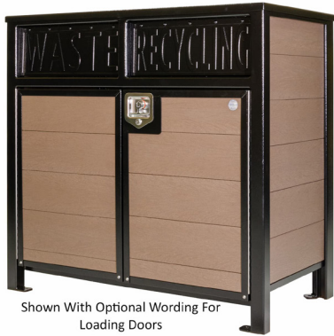
Shown With Optional Wording For Loading Doors